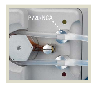
Fittings for straight-through tube sets are available when connectors are not desired

Snap-in tube sets with a wide range of tubing materials, sizes and connectors